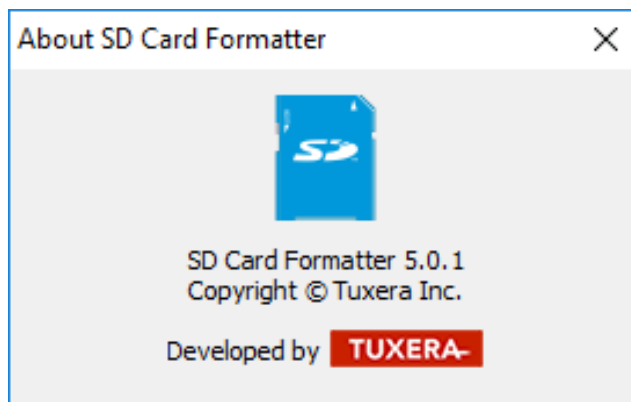
Figure 2: Version information

On macOS operating systems, click the [SD Card Formatter] menu and then click [About SD Card Formatter].